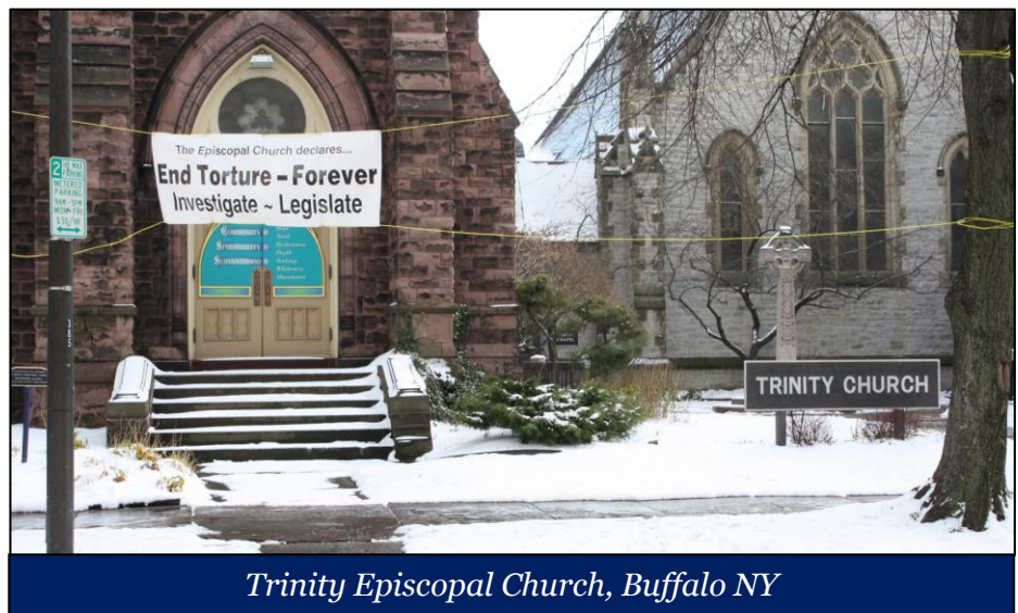
Trinity Episcopal Church, Buffalo NY

Resource: banners that can be borrowed, or advice if a congregation wishes to write its own text and purchase its own banner.